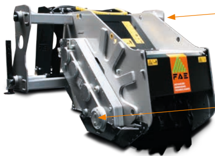
SCH/GT version with transmission and side gearbox to grind stump rows. ↑